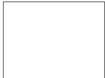
Use for Prescriber's Stamp

Prescriber's Signature: _____ Date: _____